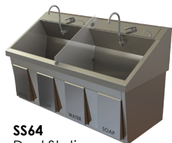
SS64 Dual Station