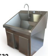
SS32 Single Station