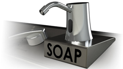
Optional Infrared Soap Dispenser