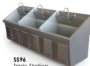
SS96 Triple Station

For more information, or to place an order, contact our customer service department at 618-476-3550 or 877-828-9975 , or by email at sales@macmedical.com .